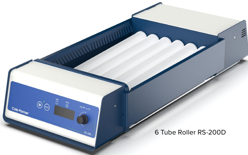
6 Tube Roller RS-200D

The Cole-Parmer® roller tubes provide the highest levels of versatility allowing the roller mixers to conveniently detach to accommodate larger vessels and therefore allow the user to mix a wide variety of differently sized tubes and bottles.